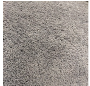
Roll 0773 - Synthetic Grey Twist Pile $139 L/m / $38 m2