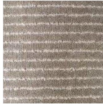
Roll 0504 - Cut and Loop Pure Wool Carpet / Coffee $145 L/m / $39 m2