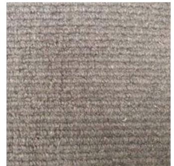
Roll 8562 - Wool Sisal Style / Dark Brown $149 L/m / $41 m2

ALL CARPETS ARE PRICED IN LINEAL METRE AND SQUARE METRE, INSTALLED ON TOP QUALITY AUSTRALIAN MADE UNDERLAYS