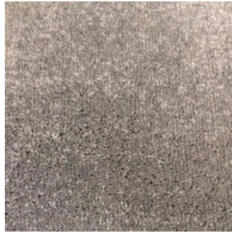
Roll 0776 - Synthetic Brown Twist Pile / A Grade 2nd's $130 L/m / $36 m2