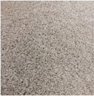
Roll 0877 : Eco 60 Oz Twist Pile $195 L/m / $54 m2