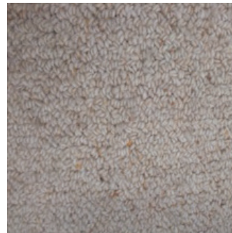
Roll 9782 - 100% Wool Berber / A Grade 2nd's $139 L/m / $38 m2